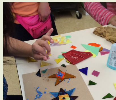
Students with developmental disabilities make ornaments and jewelry as part of the WINGS Program. Below, students display their work at the Fall Festival.