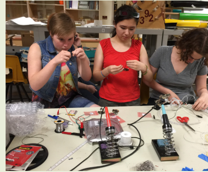
Crescent Valley students work on an open-source electronics platform as part of the Girls Only Arduino Project.