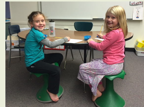
Elementary school students do their schoolwork while balancing on Hokki stools; the stools help keep students engaged by providing opportunities for movement.