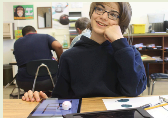
Cheldelin Ozobot Mini Robots