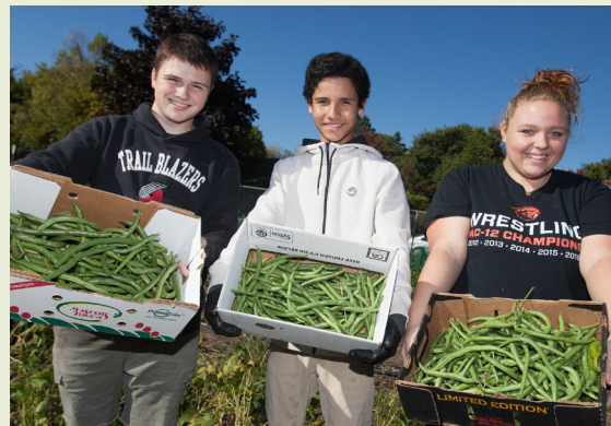
Bean Harvest at the Urban Farm