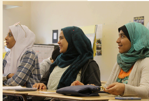
English Language Development Literature Class