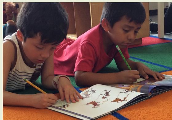
Garfield Dual Language Literacy Project

Your donations funded 34 Learning Enrichment Grants totaling $25,000 across all schools this year. These grants give teachers resources to engage and inspire students. Below are a few highlights.