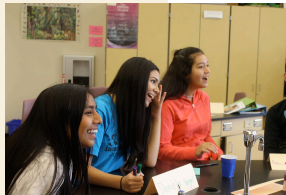
Corvallis High School AVID Summer Camp