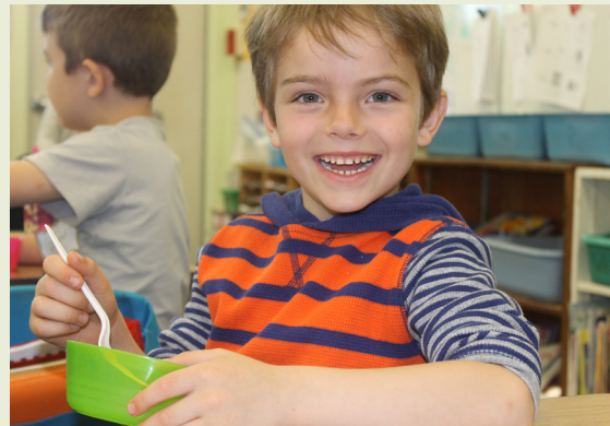
Wilson Food Adventures